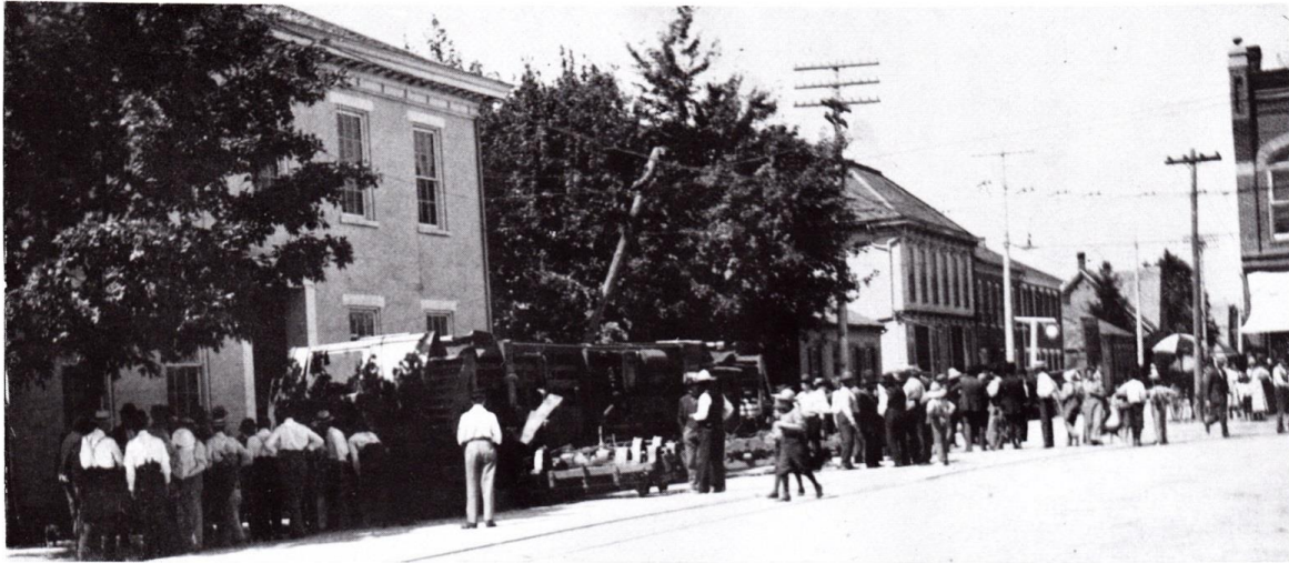
July 17, 1909 - Interurban car overturned at corner of West Monroe & Main Street