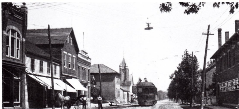
The interurban coming south down N. Main Street towards Monroe