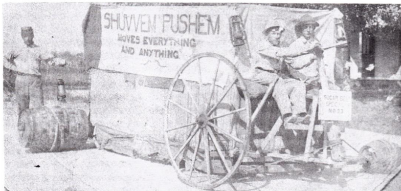
← LEFT: A "parade entry"? at the St. Marys Farmers' Jubilee (year unknown)